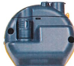
Quikstick ST POL78751, standard with all MMS3 kits and with the same performance as the standard Quikstick. A Quikstick ST can remain connected to the MMS3 while using the pins.

Readings from multiple Hygrosticks can be taken and recorded with ease. Humidity readings can be taken with the use of humidity sleeves or humidity box. Hygrosticks, not Humisticks, should be used for this test.