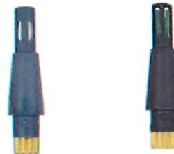
Hygrostick part number POL4750, for high moisture applications.